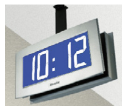
Opalys 14 on double-sided bracket