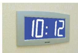
Opalys 14 recessed mounting

The NTP server must have a transmission (Poll) period of less than 128 seconds.