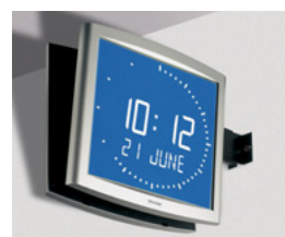
Opalys Ellipse on double-sided bracket