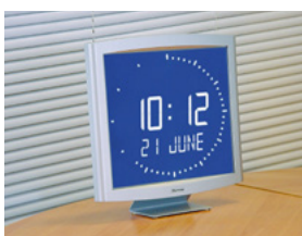
Opalys Ellipse on table support