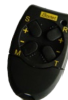
Wireless remote control